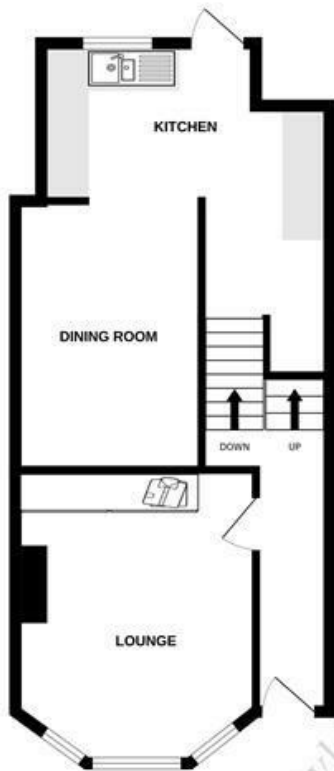
GROUND FLOOR 477 sq.ft. (44.3 sq.m.) approx.